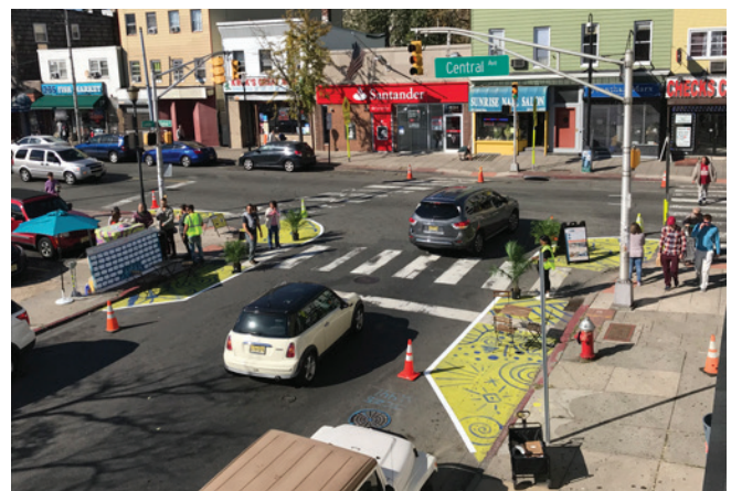
Figure 6. Demonstration Project for JC Walks Plan

Since passing its resolution in 2011, Jersey City has become a regional leader in complete streets implementation. The City developed a series of plans aiming to make its streets safer for all road users. In 2018, they completed JC Walks Pedestrian Enhancement Plan (Figure 6). This plan included temporary demonstration projects and walk audits as part of its planning process. The quick-build projects demonstrated the value of curb extensions, parklets, and cross walks to a variety of stakeholders. Participants, which included members of the public, community leaders, and agency representatives, were able to see firsthand the impact of these projects when considering design interventions in each of the city’s six boroughs. Following the pedestrian plan, the