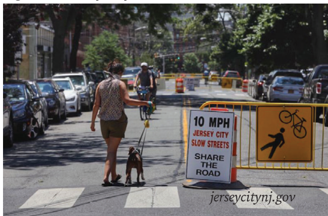
Figure 3. Jersey City Slow Streets

This rapid roll-out of more complete streets, however, has not happened without criticism: residents who have long felt sidelined have noted that the projects are often located in economically advantaged areas or to support businesses that are less frequently patronized by poor residents, such dine-in restaurants. Moreover, many critics have pointed to the fact the process of designing complete streets has not consistently included marginalized residents or accounted for the discrepancies in power dynamics that shape the urban environment. As such, communities looking to implement quick solutions should learn from these experiences and ensure that equity considerations are embedded into their planning and implementation process.